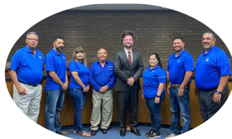
School Board OTY Fort Stockton ISD